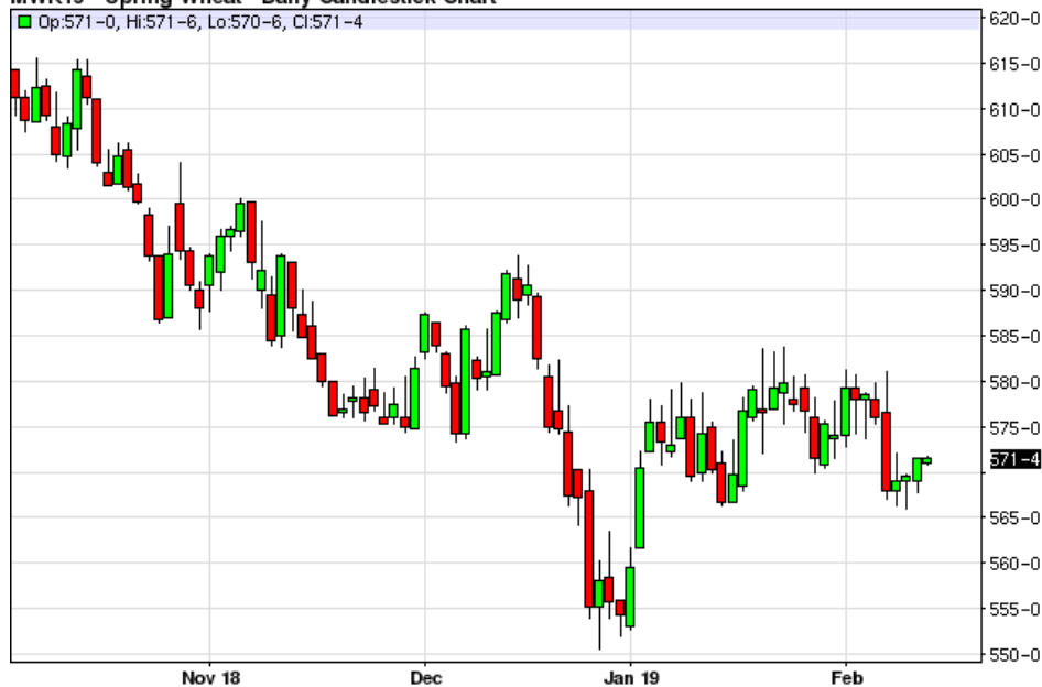
MWK19 - Spring Wheat - Daily Candlestick Chart