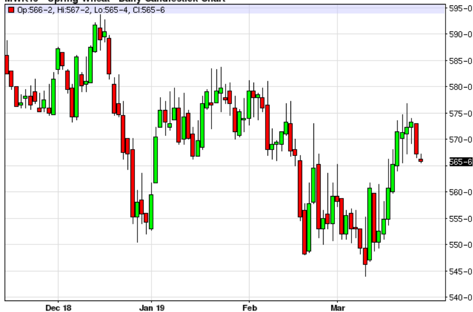
MWK19 - Spring Wheat - Daily Candlestick Chart