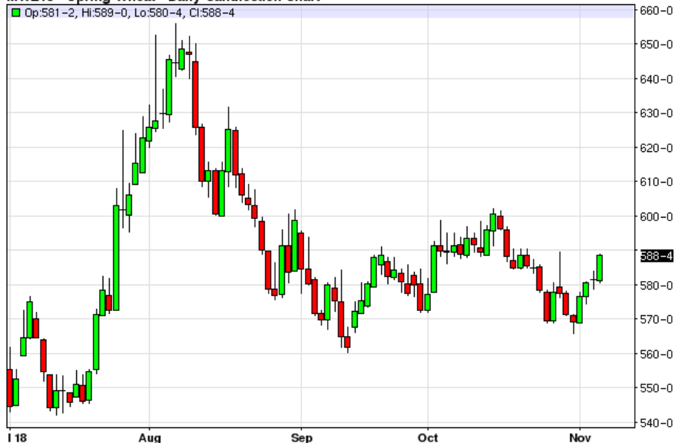
MWZ18 - Spring Wheat - Daily Candlestick Chart