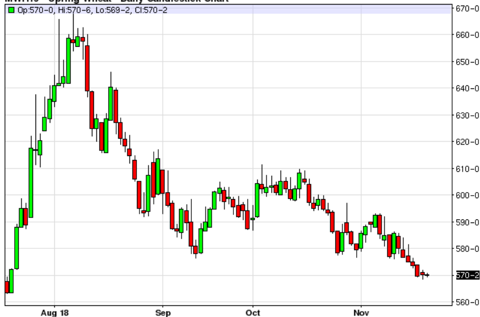
MWH19 - Spring Wheat - Daily Candlestick Chart