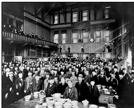
The MGEX Trading Floor, circa 1895.

The Minneapolis Grain Exchange (MGEX) is comprised of nearly 400 members and is governed by a board of directors consisting of fourteen member directors and four public directors. Members come from differing backgrounds and fulfill many roles. Representatives of multi-national companies, brokers filling orders for customers, speculators who work only for themselves and investors make up the body of the MGEX membership.