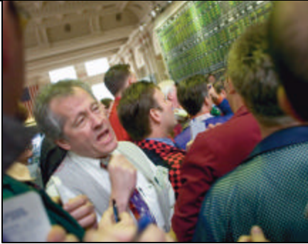
Pit traders at the MGEX.

The Minneapolis Grain Exchange (MGEX) is comprised of nearly 400 members and is governed by a board of directors consisting of fourteen member directors and four public directors. Members come from differing backgrounds and fulfill many roles. Representatives of multi-national companies, brokers filling orders for customers, speculators who work only for themselves and investors make up the body of the MGEX membership.