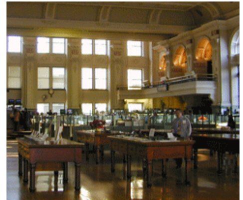
MacDonald and Mack have completed various projects at the Minneapolis Grain Exchange, including space planning for the Trading Floor

Congratulations to MacDonald & Mack, Grain Exchange Building tenants since 1979, for being awarded the prestigious 2011 Firm Award by the American Institute of Architects (AIA). The biannual award is presented to the firm who has contributed to the advancement of architecture in the areas of technology, service and design.